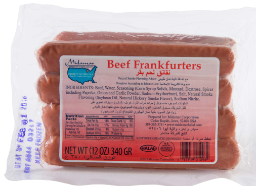
Individual Package Label ↑